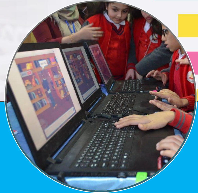
Games Design Program